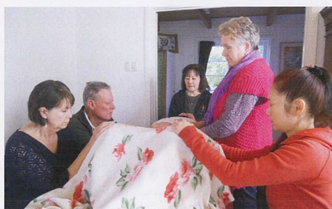
Learning Japanese Reiki Techniques

2018 has been another great year for me, a mixture of private adventures and public endeavours. Reiki self practice, providing treatments to members of the public, volunteering and teaching classes, remain absolutely central to my life. In addition, I participated in a Japanese Reiki 1 class to learn some of the energy sensitivity exercises that were an essential part of Usui's treatment practices. After over 27 years of being a Reiki practitioner and teacher, it was very interesting to once again be (just) a student; I enjoyed the teaching and am committing more time to developing those sensitivity experiences for my treatments.