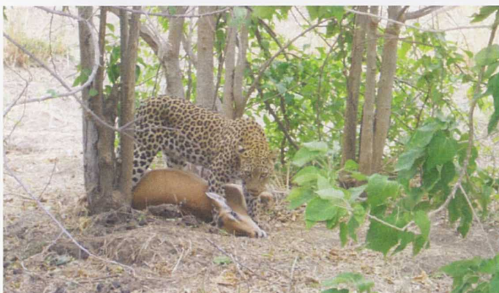
On safari in Zimbabwe

So perhaps there are at least two great truths; it's an inner journey and it's your responsibility. As Reiki practitioners, that journey is both literally and metaphorically, in your hands!